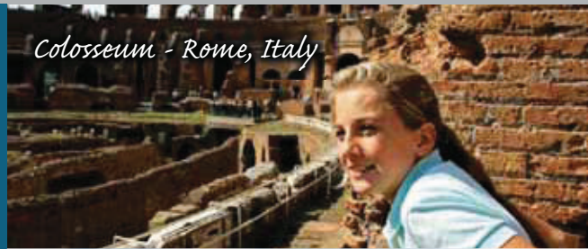
Colosseum - Rome, Italy

With medical coverage from 5 days to 1 year, the Atlas Travel plan from HCC Medical Insurance Services (HCCMIS) is with you almost anywhere on the planet you may travel for vacations, studying abroad, corporate travel, mission trips and extreme sports adventures.