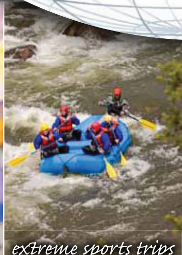
extreme sports trips